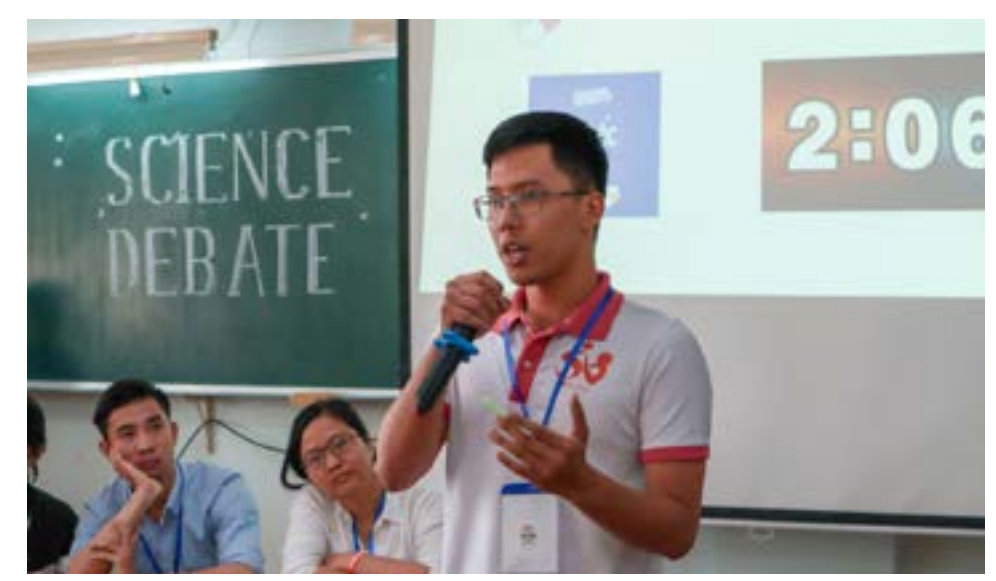
Photo: Science debates to engaging Vietnamese young people and scientists to use debate as a tool for discussing health science-related topics in Viet Nam.

Objectives Building trust in a time of public health crisis through public and community engagement, including: • Building dialogue between public and experts; • Listening to communities; • Empowering communities through knowledge transfer;