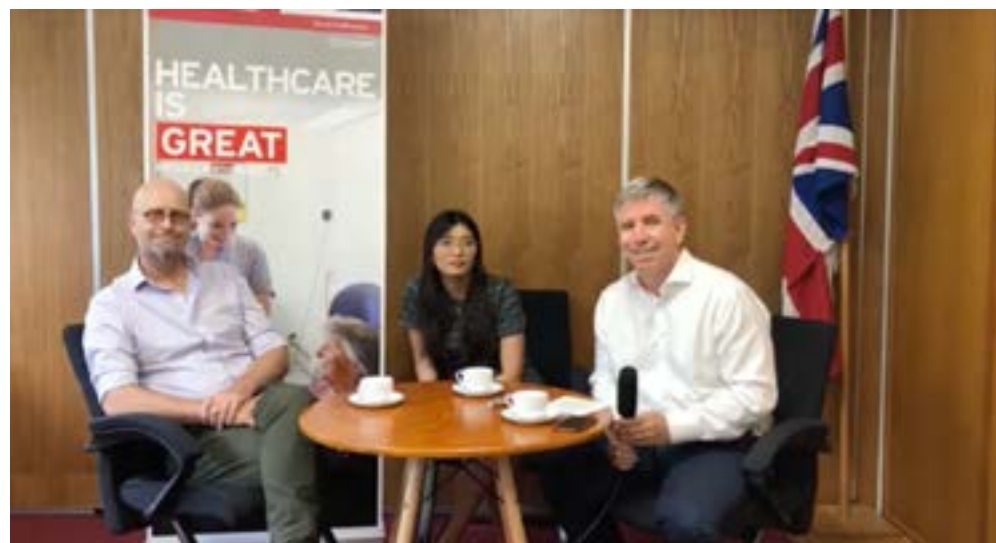
Photo: Livestream session: Covid-19 Myths & Truth. British Embassy in Viet Nam. June 9, 2020.