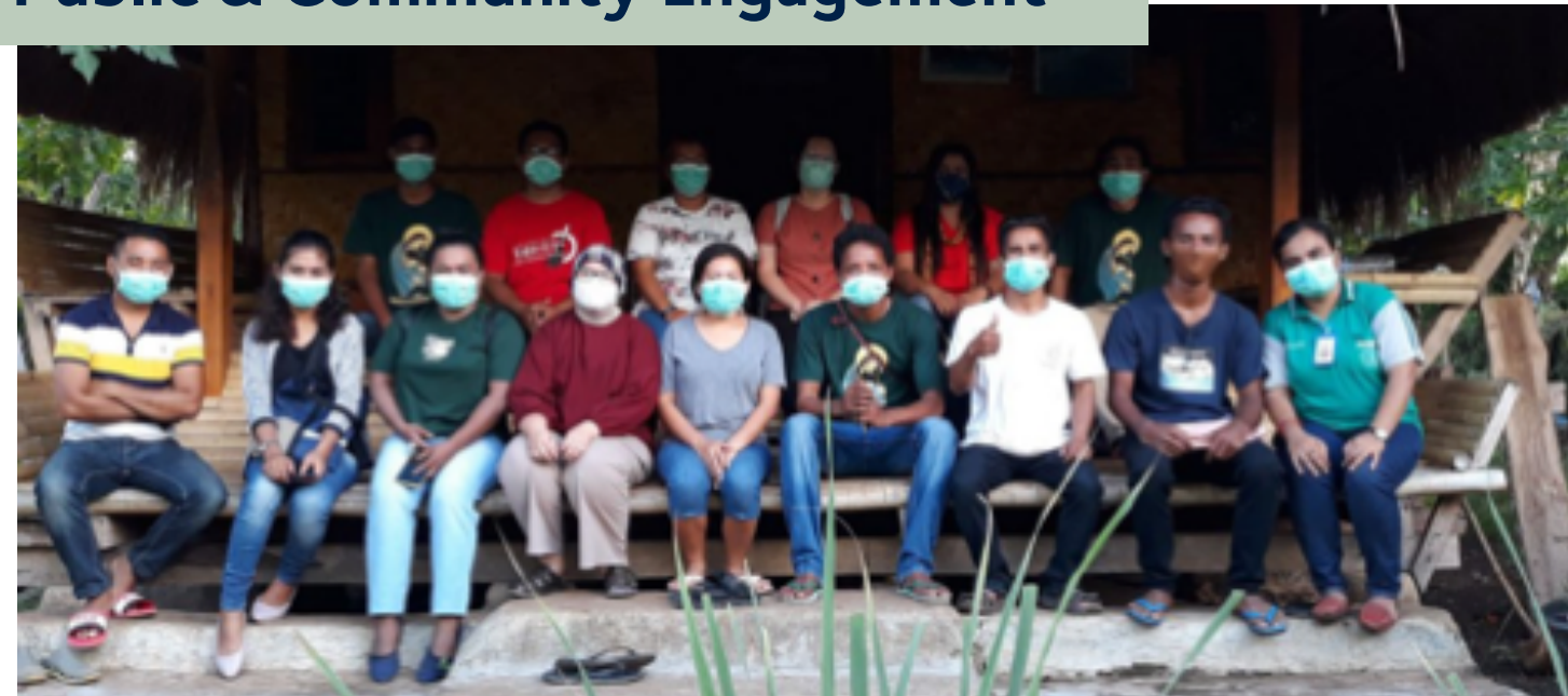
Photo: Digital diary participants from West Sumba, Eastern Indonesia